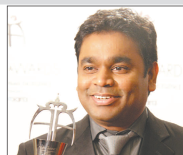
A R Rahman